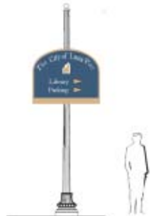
Pole Mounted Directional Sign