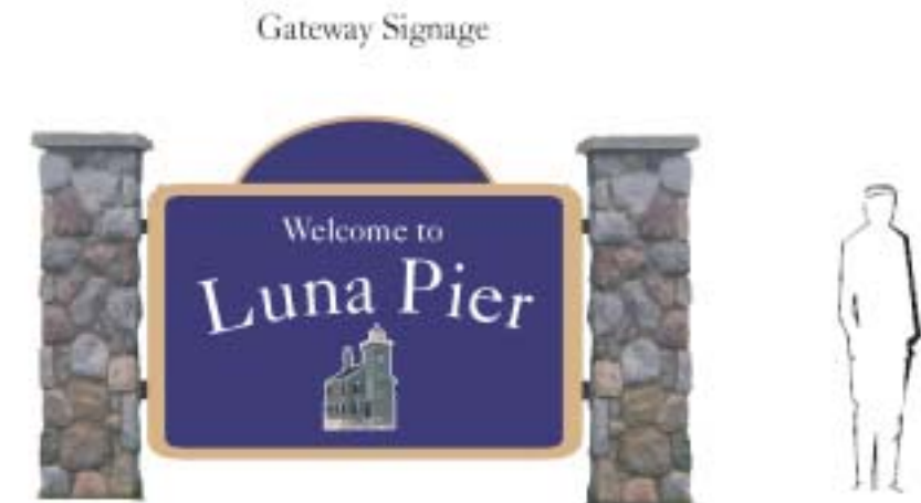
Ground Mounted Identification Sign

Luna Pier hopes to attract visitors as an important part of its economic development strategy. This consideration underscores the need for a user-friendly and functional signage system to help visitors become oriented and comfortable in